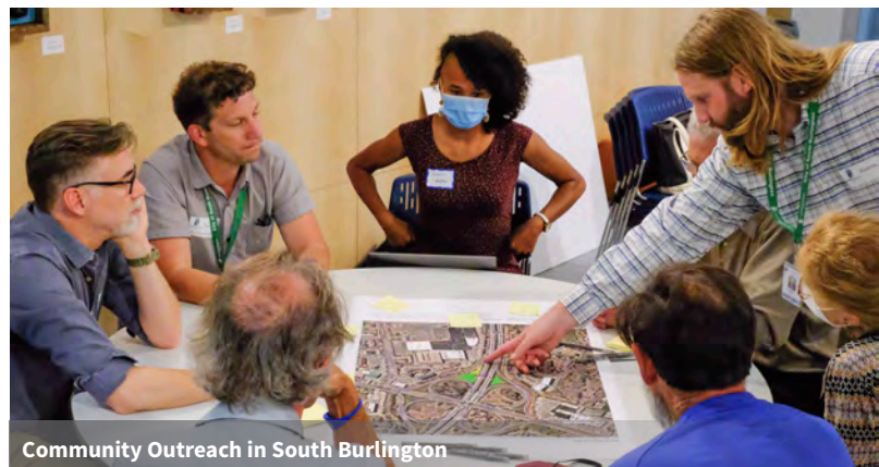
Community Outreach in South Burlington

A critical component of any public project is to maintain clear communications among the municipal staff, local stakeholders, state agencies, and the community, as well as establish channels to raise questions and find answers in a timely and cost-effective manner. The results of such a collaborative process will be consistent messages, public awareness and education, stakeholder buy-in, a consensus on priorities, and a project that meets the municipality's needs and the public's expectations.