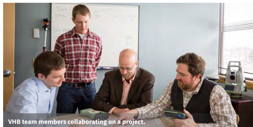
VHB team members collaborating on a project.

One advantage that VHB offers is that all of our MPMs are engineers. They understand the design and construction aspects of their projects, and provide an additional layer of checks and balances to verify that the engineering design is sound, and the construction is being performed in accordance with the municipality's and designer's intentions.