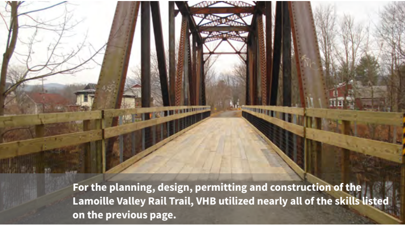
For the planning, design, permitting and construction of the Lamoille Valley Rail Trail, VHB utilized nearly all of the skills listed on the previous page.

We've put together a team in this proposal that reflects VHB's continued commitment to improve mobility, enhance Vermont communities, and balance development and infrastructure needs with environmental stewardship. While every project does not require this deep pool of talent, the resources are there when needed and our Vermont team can continue to call upon these key people as they have in the past.