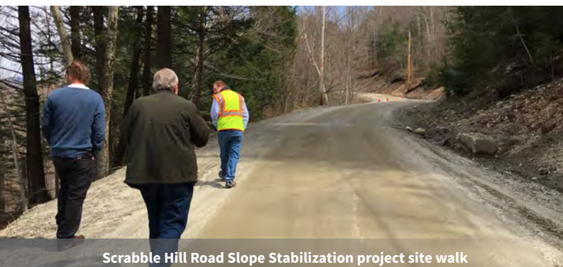
Scrabble Hill Road Slope Stabilization project site walk

VHB has provided Project Management Services directly to VTrans on many assignments. We know and understand their process!