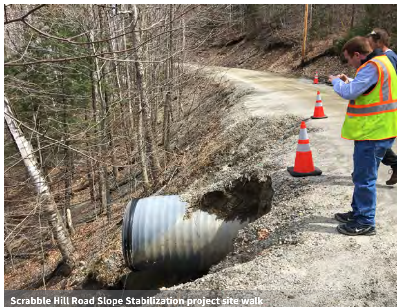
Scrabble Hill Road Slope Stabilization project site walk